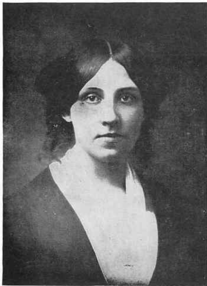
LOUISA MAY ALCOTT