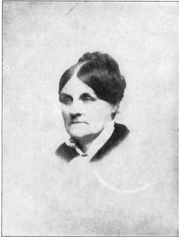
ABIGAIL MAY, MRS. A. BRONSON ALCOTT From a daguerreotype

could surround her mother with every comfort that could make her happy in her last declining years. Not less had she delighted in gratifying every wish of her father.