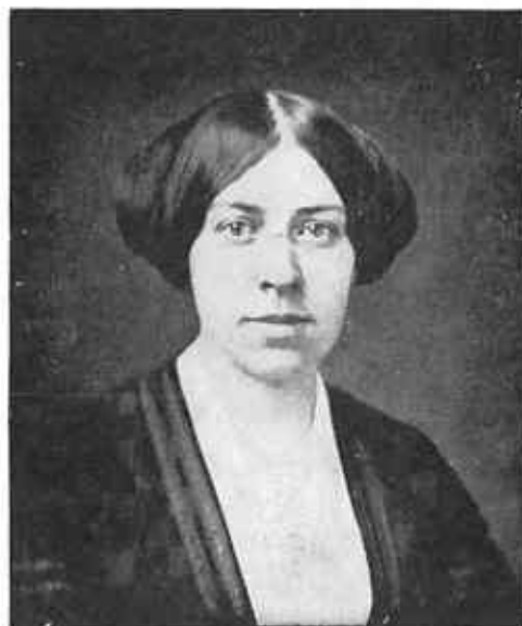
ANNA BRONSON ALCOTT ("Meg") From a daguerreotype

While in Rome Miss Alcott received the sad news of the death of her brother-in-law, Mr. Pratt. She at once turned to the support of her widowed sister, Anna, and her two nephews, Frederic and John, by writing "Little