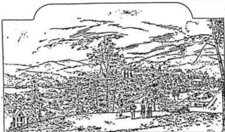
THE VILLAGE OF NORTHVILLE FROM BUCHNER HILL--LOOKING TOWARDS DETROIT

The season of winter has few if any friends in this vicinity. Such was its severity in its last visit that all dread its approach.