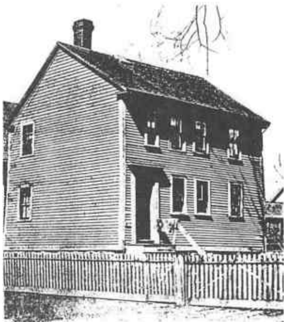
THE NATHAN ATWELL HOUSE, WHIPPING STREET, LYNN