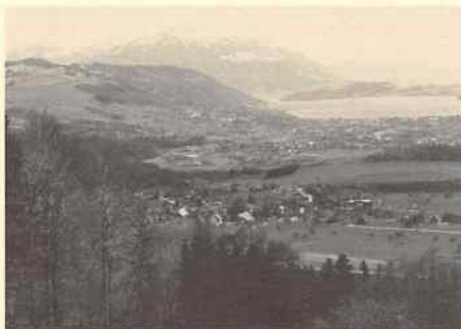
This view from Ober Albis shows Baar on Lake Zug, five miles away, and the snow-covered Alps beyond. Ebertswil lies in the foreground.