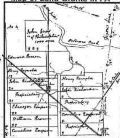
Map of Land Grants in PA