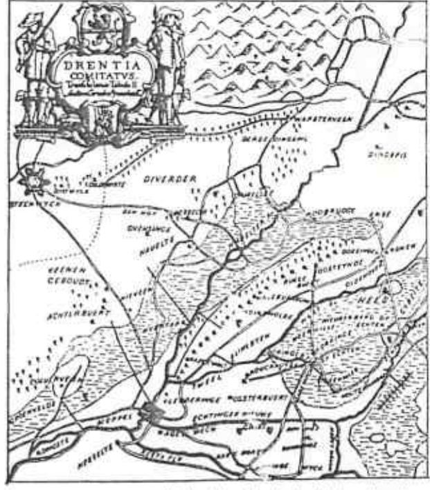
Reduced from illus, in Van Voorhees Genealogy

By the 15th century the estate had been subdivided into three manors called Voorhees (meaning before or near the town of Ruinen in the district of Hees, and hence the post-migratory surname), Middelhees, and Achterhees, which were each inhabited by a different branch of a family known as thoe Hees ("at Hees"). Only the aristocracy in the Netherlands used the preposition thoe, with those of the commonalty using van, meaning "from." After 1574, in accordance with the