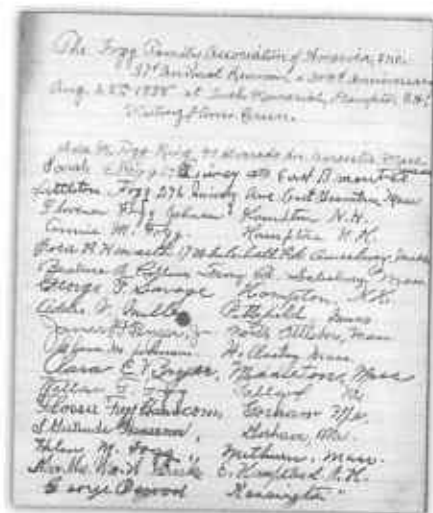
Detail from the Fogg Association guest list, 1927–1946/47