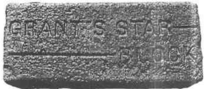
Grant's Star Block, made by the Scioto Star Fire Brick Company. The word "Grant" infers that a Grant brick machine was used.

AMERICAN SOCIETY OF CIVIL ENGINEERS PUBLISHED BY THE SOCIETY NEW YORK, N. Y.