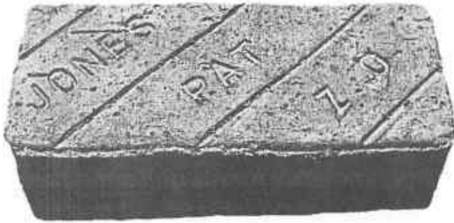
Jones paver showing the patented groove design. "Z.O." indicates Zanesville (Muskingum County), Ohio, where the brick was manufactured.