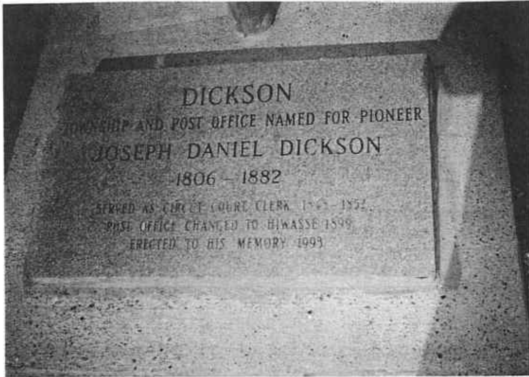
The Joseph Daniel Dickson Memorial