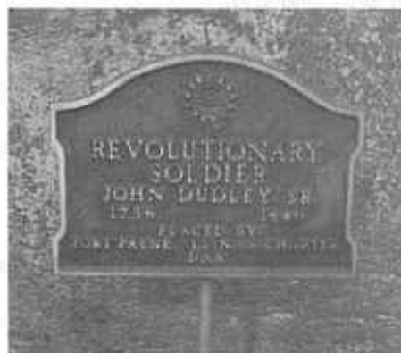
DAR Marker placed by Fort Payne Chapter, NSDAR Naperville, Illinois