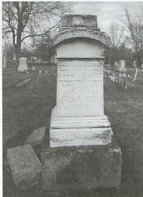
Dudley Family Monument Naperville Cemetery, Naperville, DuPage, Illinois