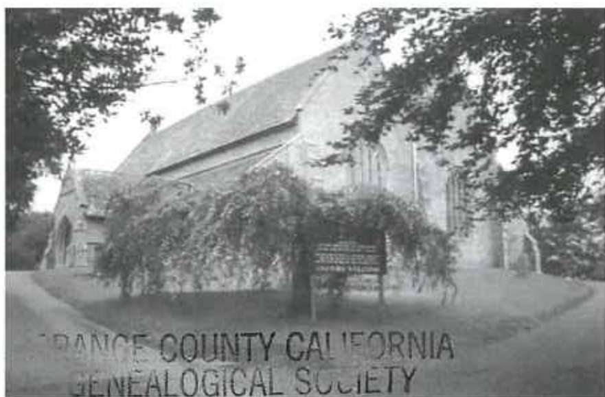
St. Mary's Church, Kington, Herefordshire

This in some respect, is the answer as to how my grandparents came to be married in Kington in Herefordshire, a long way from their birthplaces, but as grandmother was five months pregnant (aged 17!)