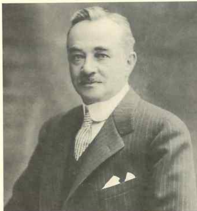
Milton Snavely Hershey (no. 1) at the age of fifty-three