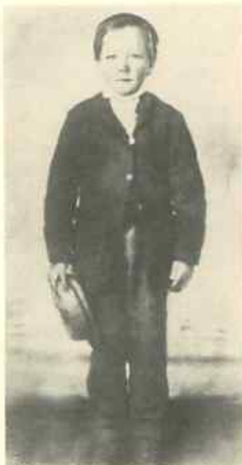
Milton S. Hershey (no. 1) at seven years of age