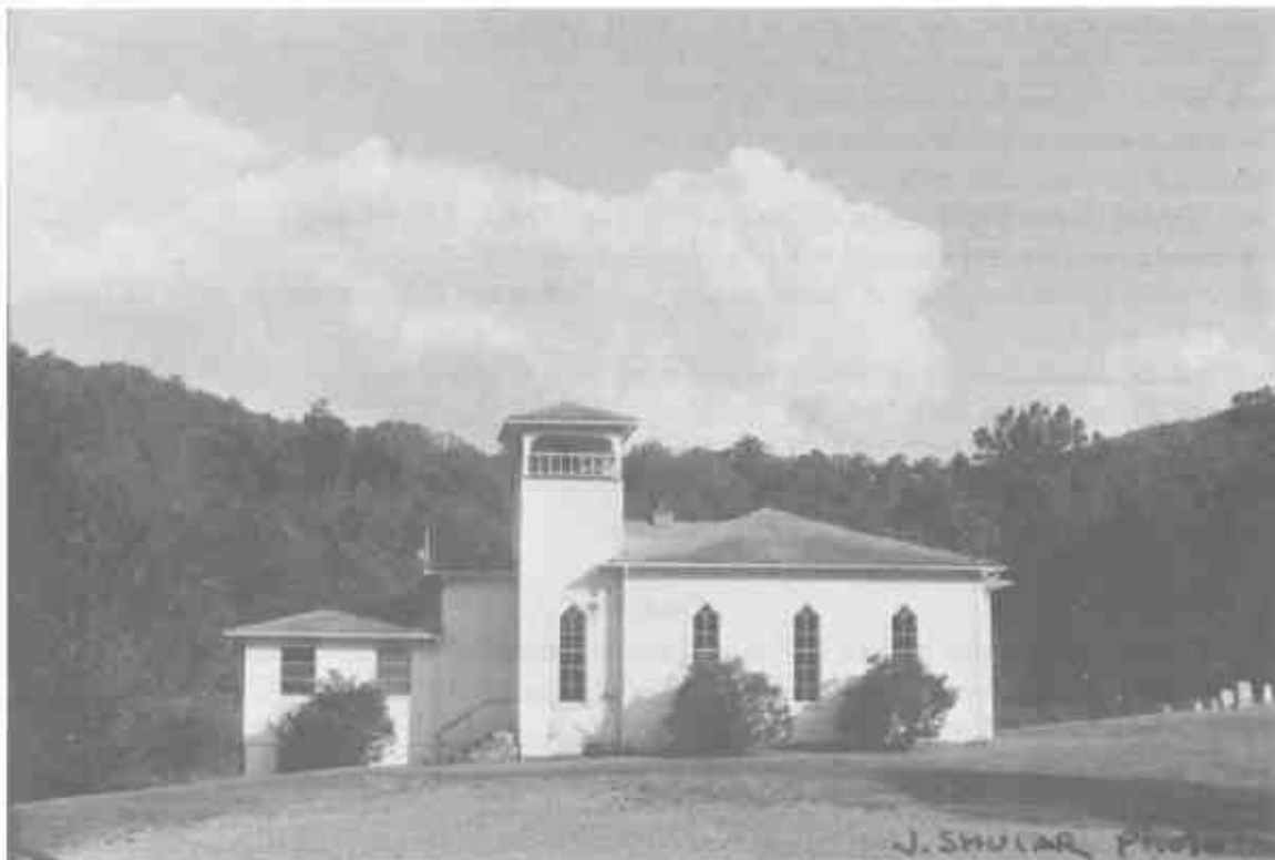
Campground United Methodist Church

Robert George Holston Conference on Archives and History