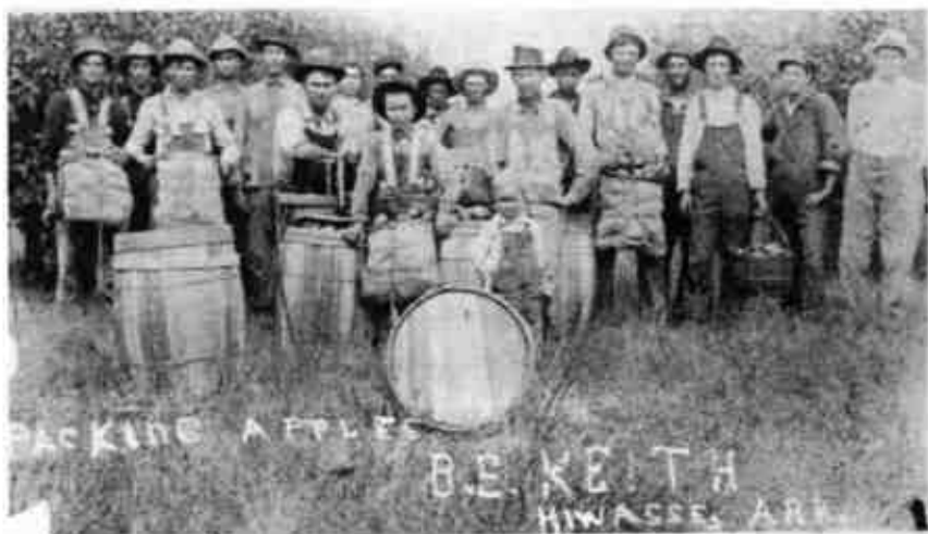
Packing Apples in Wooden Barrels at the Keith Orchards - circa 1905