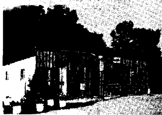
Keith's Lake Grocery Store - circa 1920