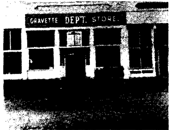
Dreisoerner's Gravette Department Store - Early 1960s