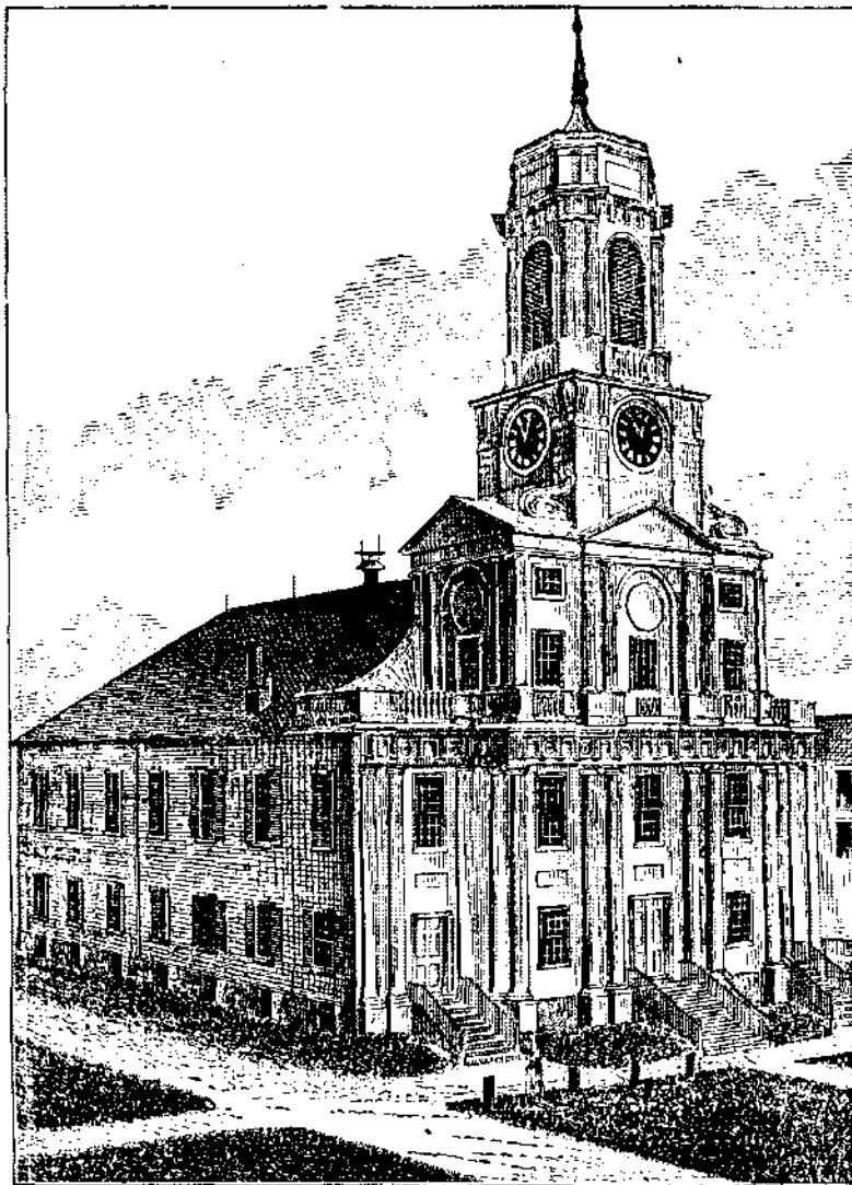
THE OLD CHURCH. BURNED 1870.

Red Forbes Library - Northampton Ma King K20