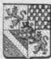
Coune(a) P de Lige