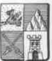
Kuhn de Kührenfeld