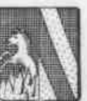
Kuhn de Kührenheim