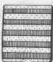
Koen P d Overweel