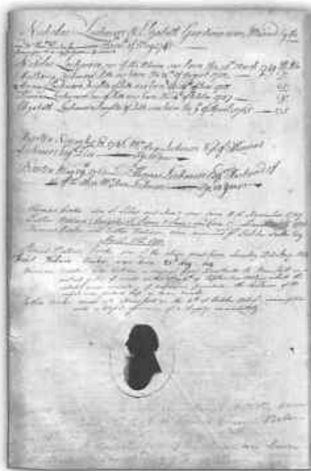
A page from the Lechmere-Cook Bible.