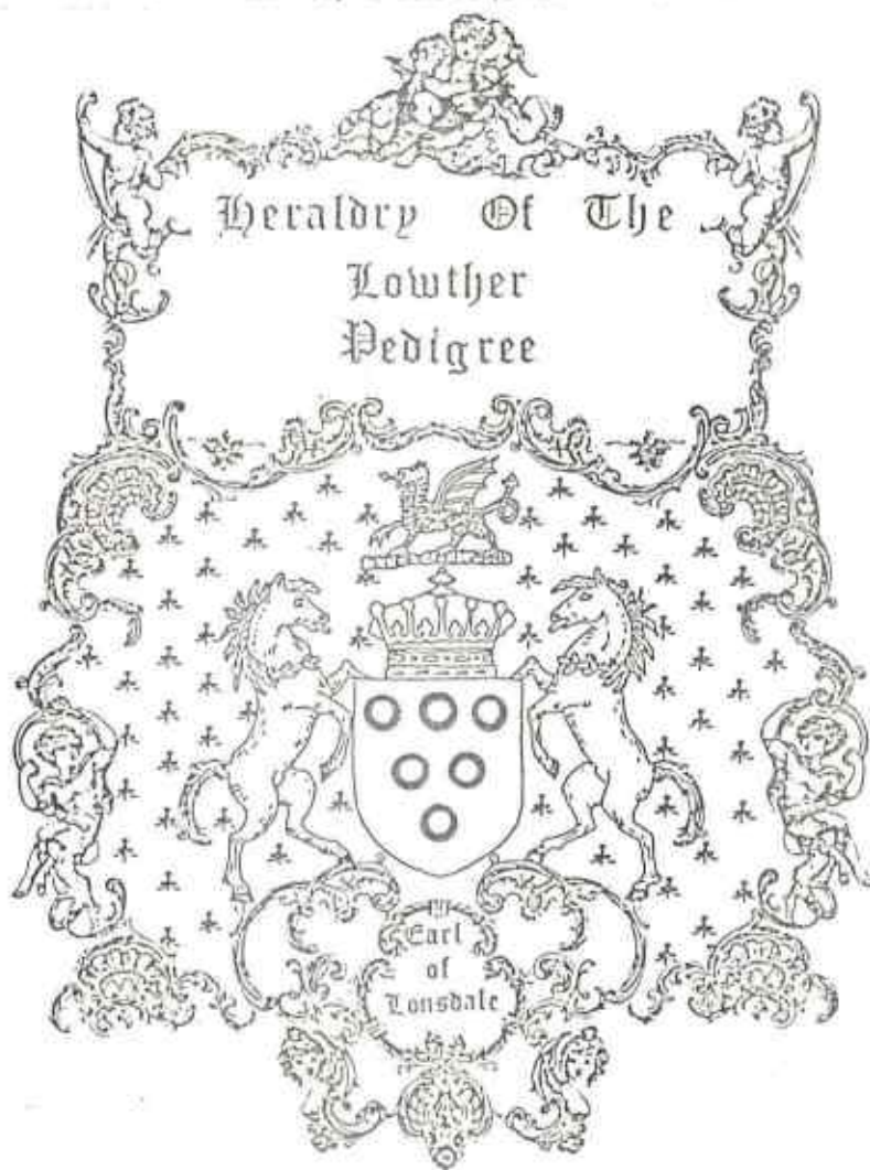
Heraldic Device Courtesy of Donald N. Moran

From way back even before the Norman conquest (1066) Lowthers owned land, lived and raised families, and fought and died in that remote northwestern corner of England bordering on Scotland. In medieval times most of the men were soldiers or knights, eager participants in the continual skirmishing along the boundry of what was then called the "western marches".