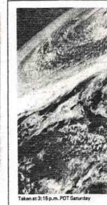
Taken at 3:15 p.m. PDT Saturday