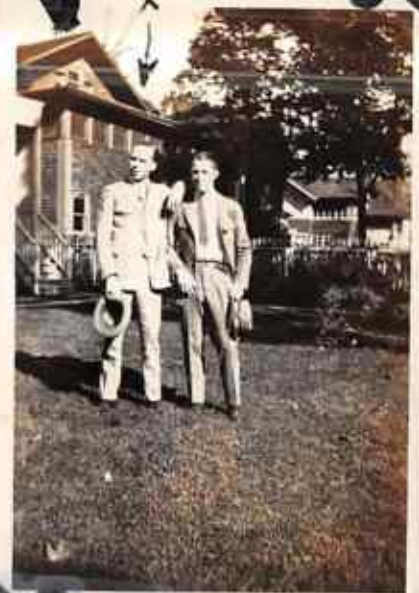
Don't forget the other side of this picture.