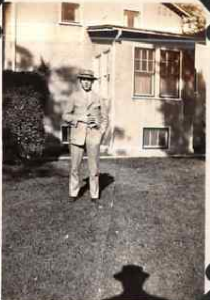
my first proposer.