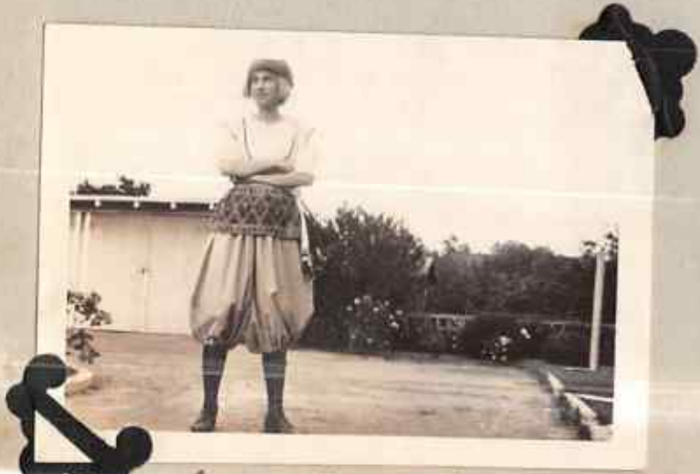
The 1st Pageant.