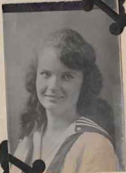
My Bunkie at Alpha Phi Also my girl at home.