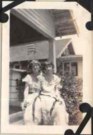
Our Junior Commencement Dresses.