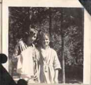
are the order of the Decemb r bells.