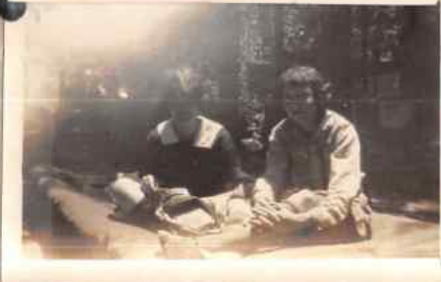
Happy Hoboes at Happy Hoboes Hangout