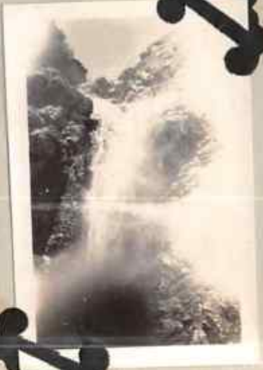
Some slippery climb to get this picture.