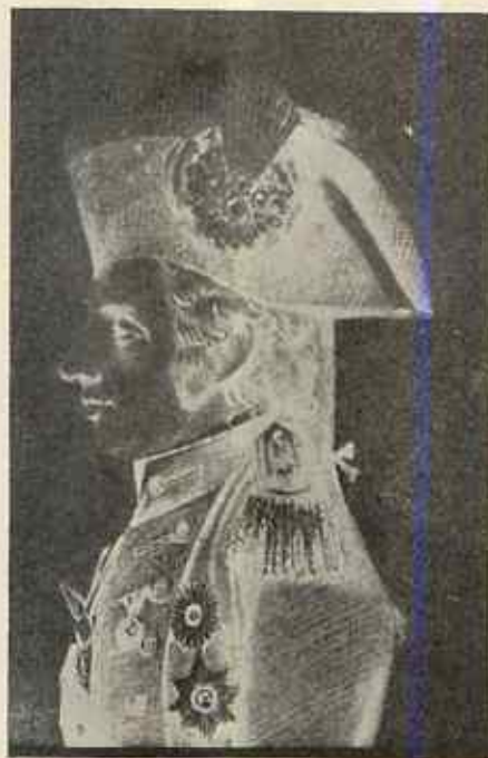
LORD NELSON Hero of Trafalgar See Chapter (C)