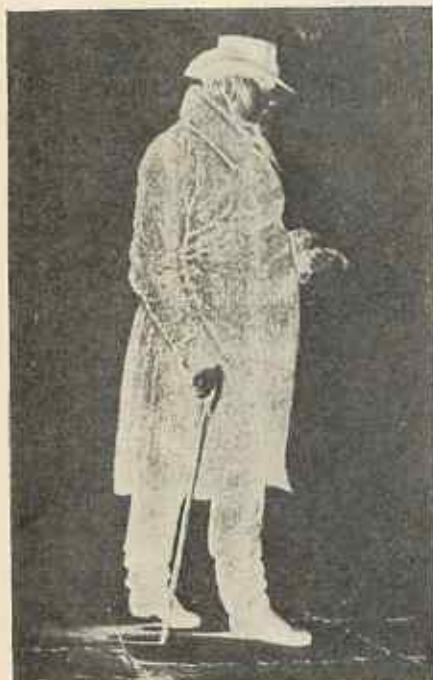
THE FIRST EARL NELSON See Chapter (B)