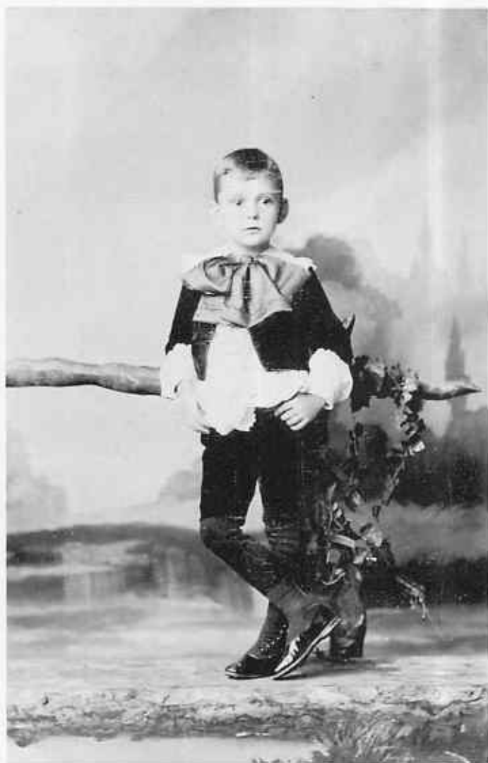
ELMER GARFIELD VAN NAME (ca) 1893