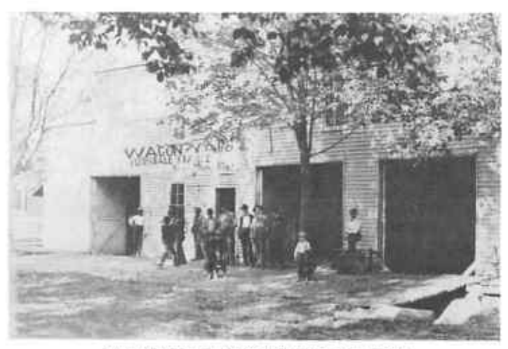
Best Wagon Yard & Livery Stable, 1900