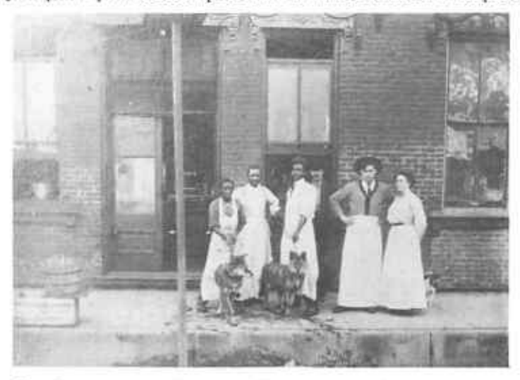
Best Restaurant and Saloon on Front Street, before prohibition.

The following pictures are in the files of the Jackson County Historical Society. Copies were made available to the JCHS by a member of the Best family. Captions printed below photos are as written on backs of the pictures.