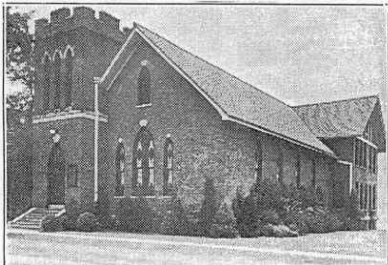
PINE STREET PRESBYTERIAN CHURCH