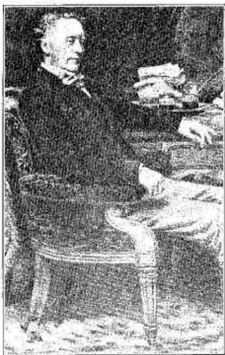
WALTER FRANCIS MONTAGU DOUGLAS SCOTT, Duke of BUCCLEUCH AND QUEENSBURY, K. G. (See page 19)