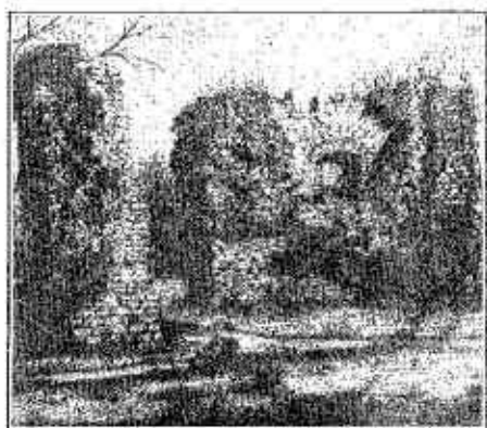
THIRLESTANE TOWER Site of the ANCIENT SCOTT FAMILY