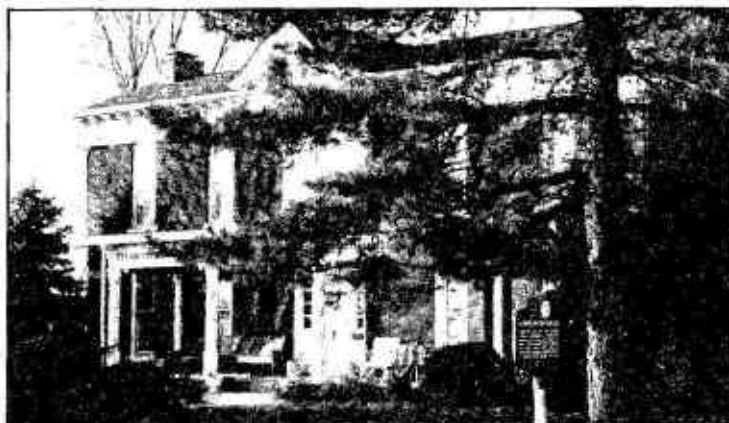
302 W. Mill Independence, Missouri