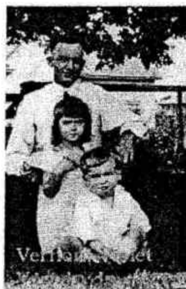
Vernon + Violet

ORANGE COUNTY CALIFORNIA GENEALOGICAL SOCIETY