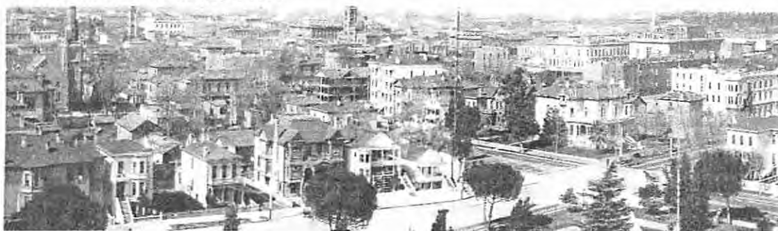
Panorama of Sacramento, c. 1901