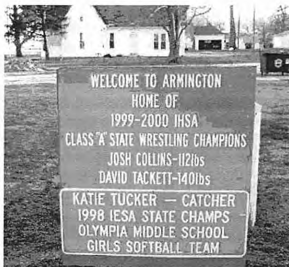
Armington has lost its old high school, but not its pride in its student athletes, who now attend Olympia