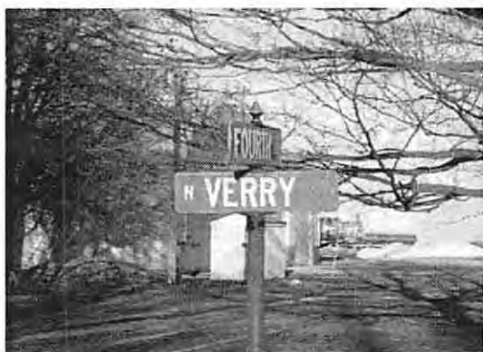
Verry Street can be found at the east end of the village. It's one block long.

I t is only inconvenient to find gold if you really need to find something else. For example, when someone is mining for silver or diving for pearls, gold is just something that happens by accident. On the other hand, it can also be ten dollar bill the casual pedestrian finds in the gutter when no one else is around. In other words, a windfall.