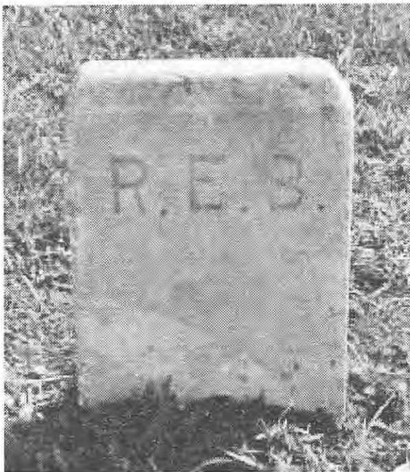
R. E. B. foot-marker