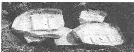
5 fragments (including Roush)

Here is a complete pictorial list of the stones found in the barn and reset at Lakeville Cemetery: