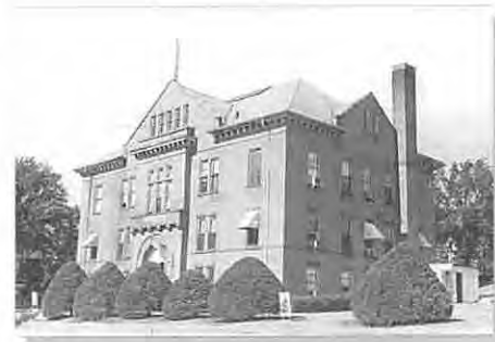
Big Stone County Courthouse, 1972