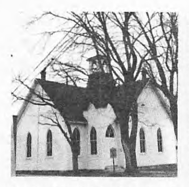
BELFAST PRESBYTERIAN CHURCH In the village of Belfast, Ohio. State Route 785.