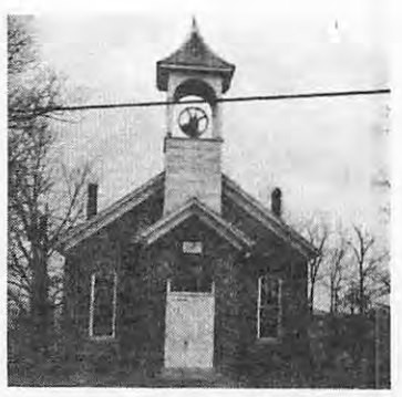
MARSHALL PRESBYTERIAN CHURCH In the village of Marshall, Ohio. State Route 124.