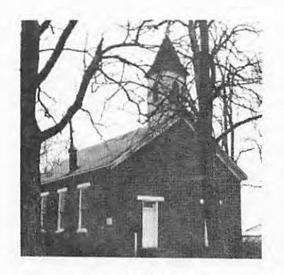
NEW MARKET PRESBYTERIAN CHURCH In the village of New Market, Ohio. State Route 62.