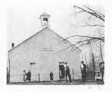
Pondlick Pike, near Hook-Morgan Road Intersection, Concord Township, Highland County, Ohio.