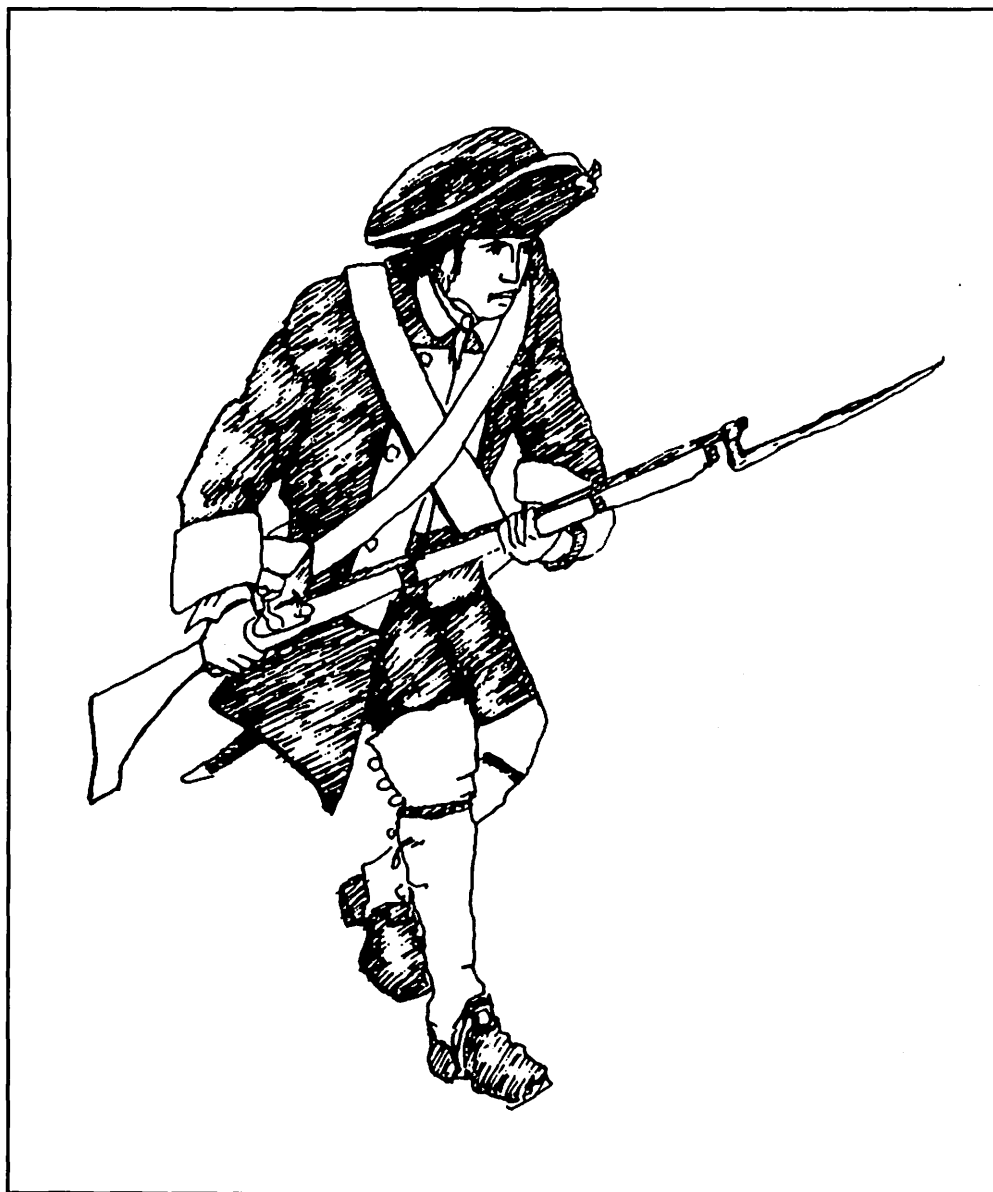
Enlisted Man - 1st Company Catalonian Volunteer - 1798